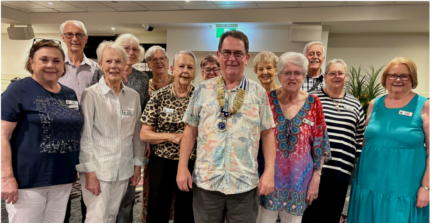
All the Presidents women (plus two males) after the elections at the 2024 Annual general meeting